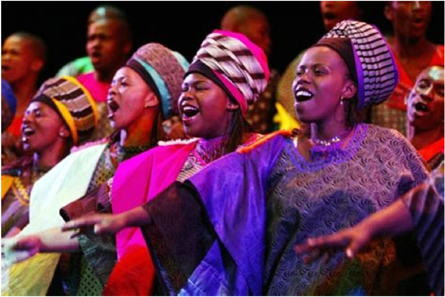
A cappella singing group home free. Royalty free acapella singing. Singing acapella free.